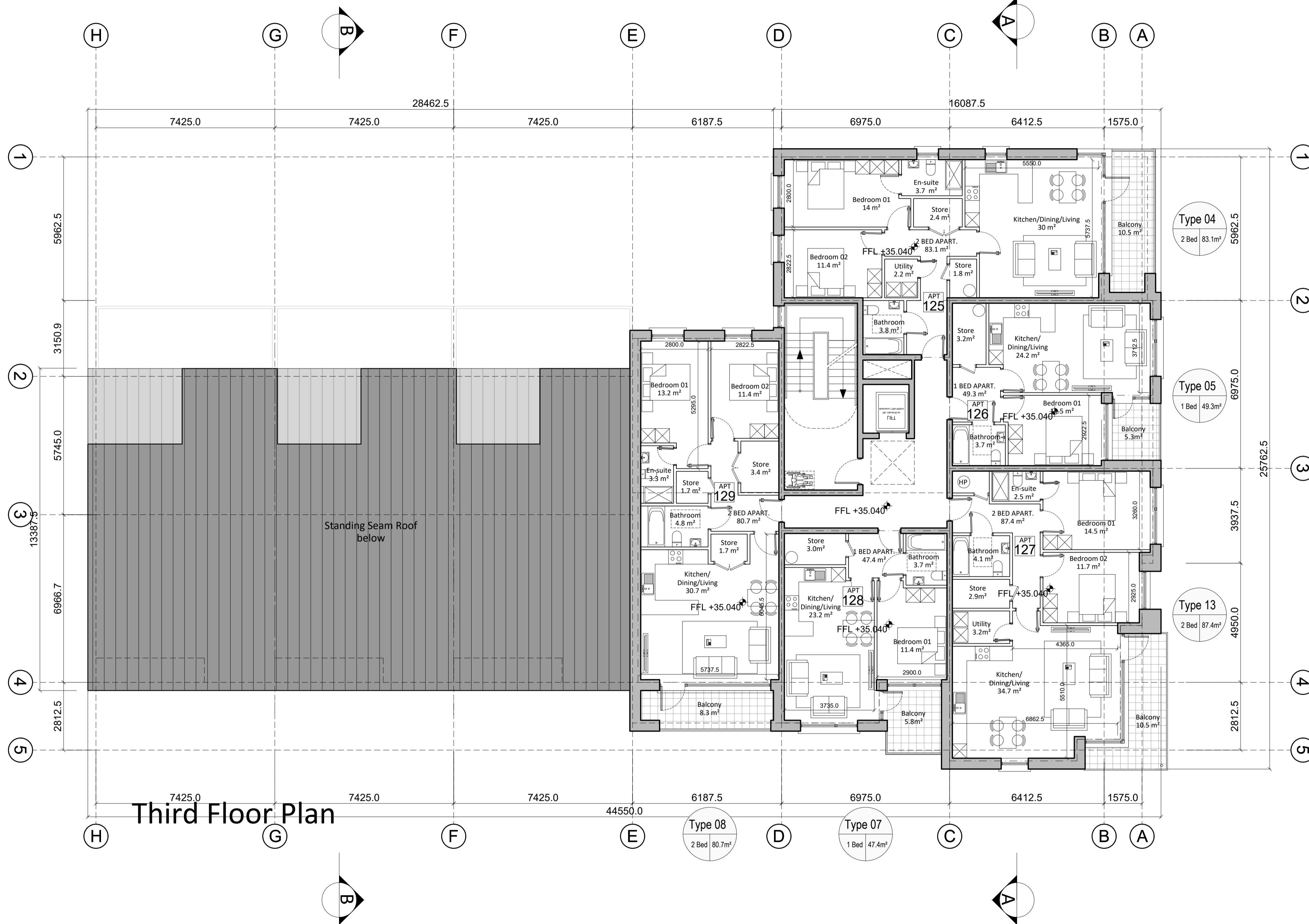
Third Floor Plan

NOTE: Do not scale from this drawing, written dimensions only to be used. This drawing is for planning purposes only & not for construction. Levels shown are for information purposes only & may not relate to O.S. Malin Head Datum. For actual O.S. Malin Head Datum always refer to the Site Layout Plan. DDA Architects Ltd. retain copyright and ownership of this design which is not transferable.